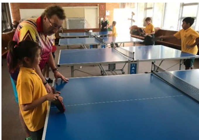
Students enjoying the Thursday afternoon Table Tennis Coaching