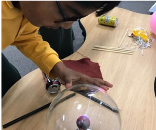
Stage 3 Team

This term in Stage Three students are learning about the transference and transformation of energy in Science. To support this learning, students actively participated in an incursion with Fizzics Education. Students had the opportunity to explore the science of energy during the 'Create a Buzz' Workshop. Check out some of the 'scientific' experiences in the photos!